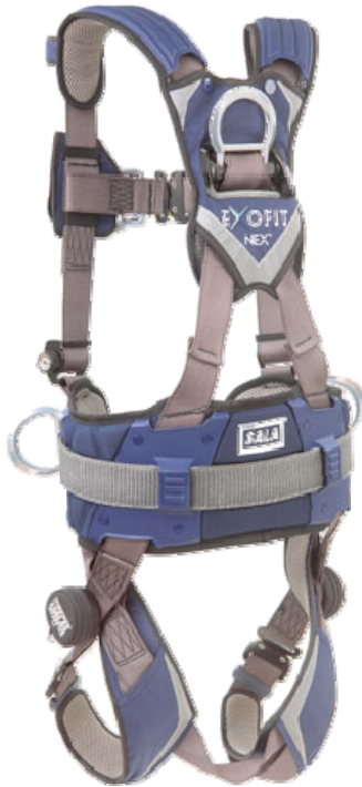
Model 1113121 Shown (Back)