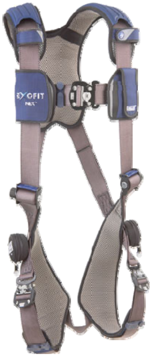
Model 1113004 Shown (Front)